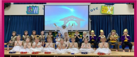
A Baby Grow