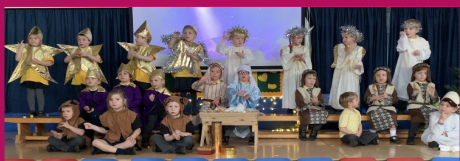
The First Christmas