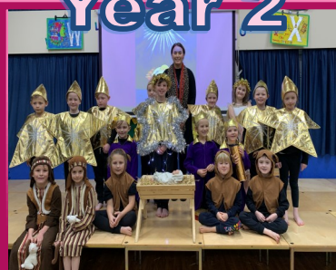
Shine Star, Shine.